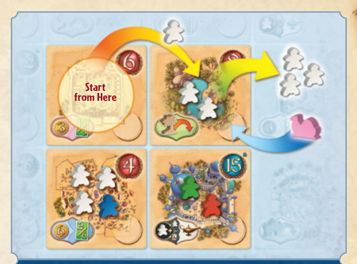
Moving onto the Tile already containing 2 White Meeples and none others, you end with 3 White Meeples in hand and take control of that Tile; if you'd opted to end your move on the Tile containing 3 White Meeples and 1 Blue one, you'd have 4 White Meeples in hand, but no control of the Tile.

place one of your Camels onto it to mark your ownership. At the end of the game, you will score the VPs associated with each Tile your Camels sit on.