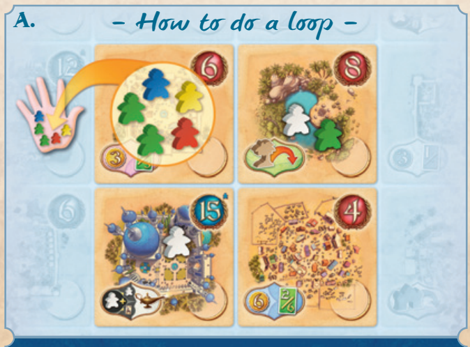
It takes at least 5 Meeples to complete a loop.

The second red Meeple cannot be dropped on the Small Market Tile, as this would be a backtracking move.