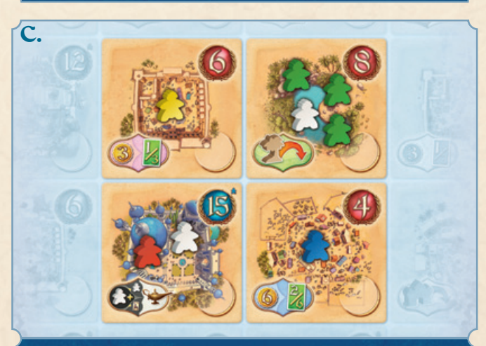
This move let the player regroup 3 green Meeples in the Oasis: he can now use these Merchants. The other Meeples were dropped on the other tiles during the move.

When discovering the game, we recommend laying the Meeples you drop down sideways rather than up, as you plan your move, so as to be able to back up if need be, during the planning stage of your move. Just remember to stand the Meeples back up once your move is complete.