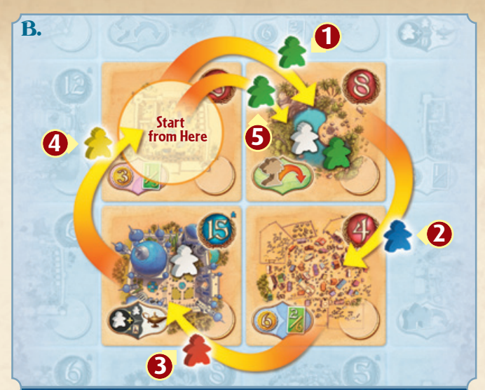
Taking all the Meeples from the Small Market tile in hand, the player then drops a green Meeple on the Oasis (1), a blue Meeple on the Big Market (2), a red Meeple on the Sacred Place (3), a yellow Meeple on the Small Market (4), and the last green Meeple on the Oasis (5).