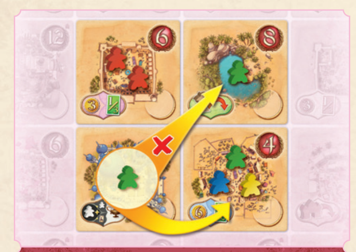
This green Meeple cannot reach the Oasis.

→ No Diagonal rule: All Meeples moves must be done sideways, from Tile to adjacent Tile, never in diagonal.