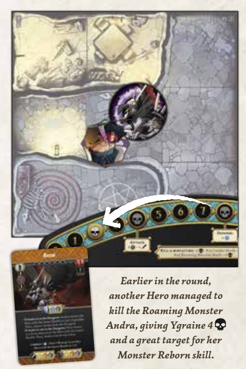
Spending a hefty 6 $\infty$, Ygraine revives the mighty beast as her new Revived Roaming Monster. Taking Andra's miniature, Ygraine's player places a Bind token under its base then takes Andra's Roaming Monster card and places it next to their Hero dashboard for reference.

Necromancers can always at most control 1 Revived Roaming Monster (regardless of the level of the Monster Reborn skill). If the Necromancer already controls a Revived Roaming Monster, they cannot revive another Roaming Monster until the one they control is killed.