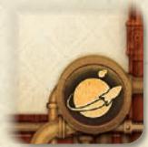
Final Scoring Phase

At the end of the reveal discovery phase, the first player advances the round tracker to the next notch.