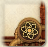
Reveal Discovery Phase

The first player flips all discovery cards in play faceup. Each discovery card effect resolves during the phase indicated by the icon in the lower-right corner of the card, as shown below.