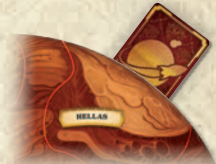
A discovery card assigned to Hellas.

Discoveries are scientific phenomena or geographical features that can be found on Mars. When a player draws a discovery card, he assigns it facedown to any outer zone of Mars by physically sliding a portion of the card under the board. At the end of the game, discovery cards provide either a positive or negative effect (e.g., that zone produces more point tokens).