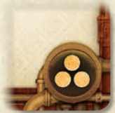
Third Production Phase