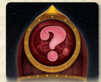
Unknown Destination Icon

Destination tokens are used by the Pilot's effect and by the player who places the first astronaut in a ship with an UNKNOWN destination. When either of these situations occur, the active player takes any destination token from the supply and places it on top of the ship's printed destination. This ship is now bound for the destination printed on the token.