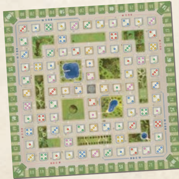
1 game board

Even behind the appearance of the most serene and romantic residential neighborhood lies fierce competition between construction companies to build it! Grab the most prestigious plots of land and build beautiful houses, but don't forget the requirements of the town plan to accumulate bonus points and claim victory!