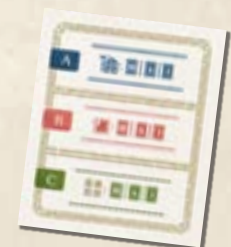
1 Reference tile