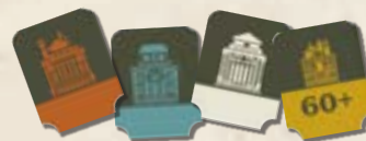
4 Scoring markers (1 of each color)