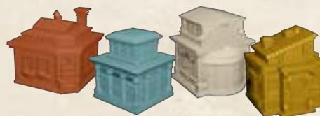
112 House pieces (28 of each color)