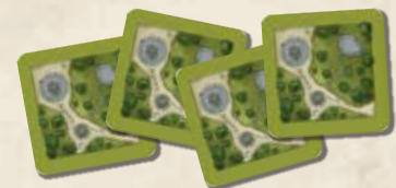
20 Park tokens