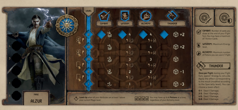
1 Player Board