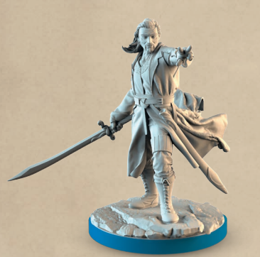
1 Mage Miniature with a color base