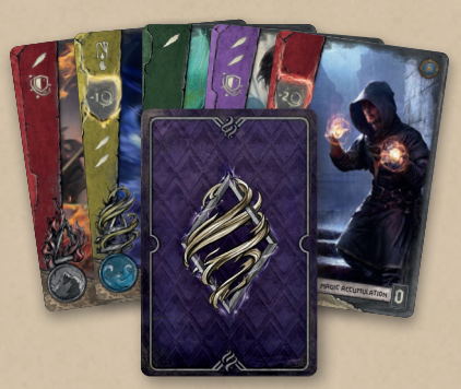
10 Starting Action Cards