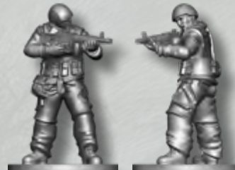
4 Soldier Miniatures