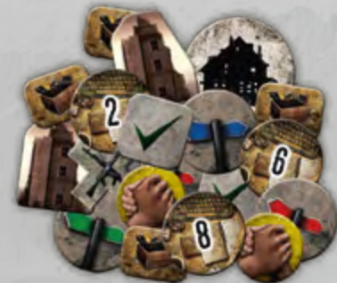
57 assorted Tokens and Markers