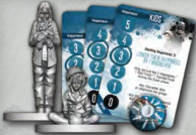
2 Orphan Miniatures, 3 Orphan Cards and 1 Happiness Token