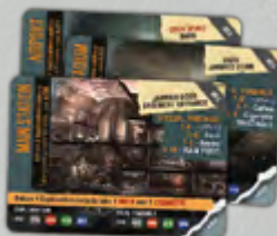
19 Location Cards (including Special Locations)