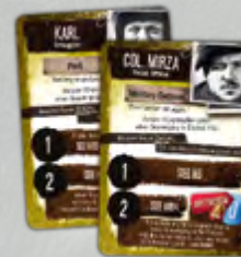
5 Story Character Cards