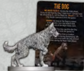
Dog Miniature and Card