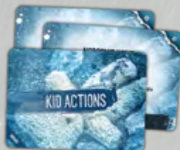
6 Kid Action Cards