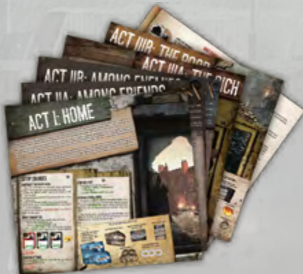
6 Forlorn Hope War Campaign Sheets (double-sided): 1 Reference Sheet and 5 Act Sheets with assorted cards, tokens and markers