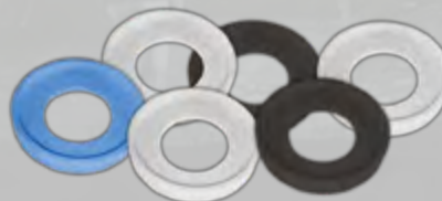
6 Base Discs in 3 colors