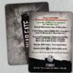
7 War Fate Cards