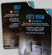
6 Kid Fitting Cards