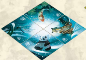
YOZUKA of Winter

Be the first to collect and complete a «YOZUKA»: The 4 different animals in the same season or a «YOZUMI»: an identical animal in the 4 different seasons.