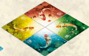
YOZUMI of Carps